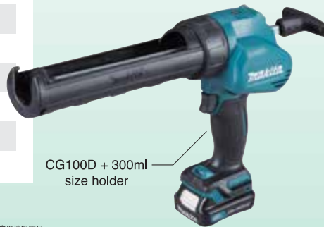
CG100D + 300ml size holder

* Actual performance may vary based on application. Prestasi sebenar mungkin berbeza mengikut aplikasi. 实际表现可能因应用情况而异。