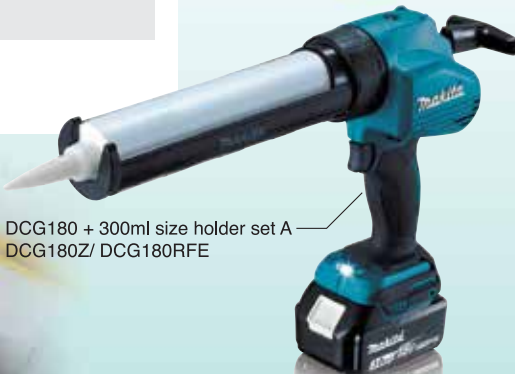
DCG180 + 300ml size holder set A DCG180Z/ DCG180RFE