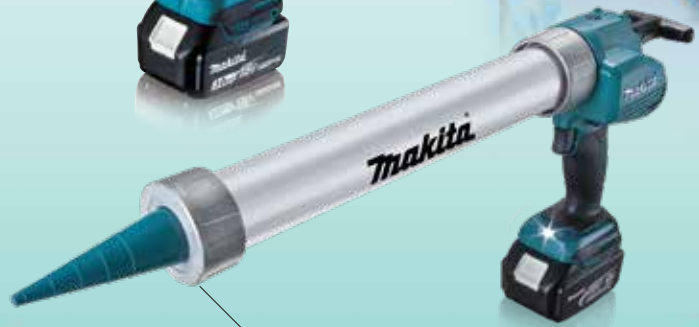
DCG180 + 600ml size holder set B DCG180ZB/ DCG180RFEB