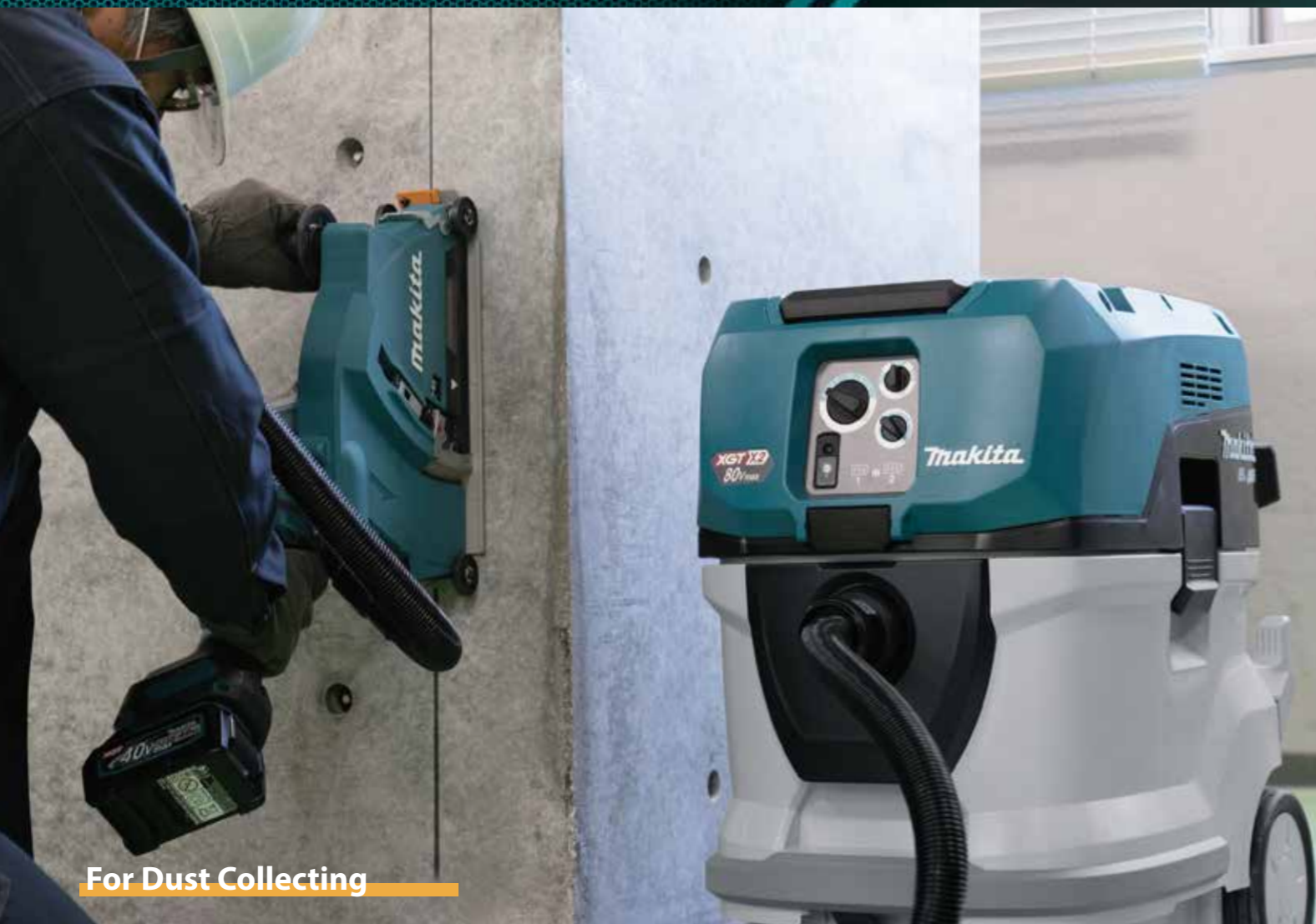
For Dust Collecting