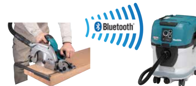
Wireless unit not integrated with the cleaner's body