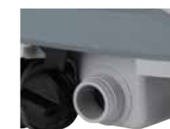
With water drain