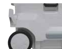
Large rear wheels