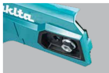
Captive nuts prevent loss of nut