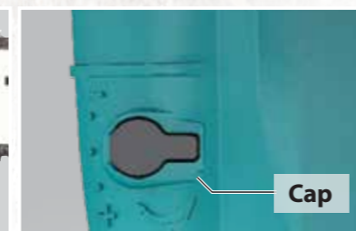
Adjustable automatic chain lubrication Cap