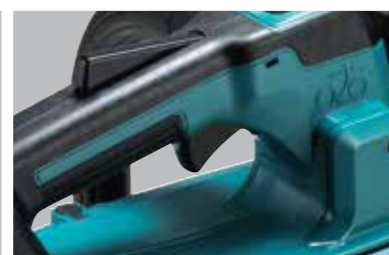
Variable speed trigger switch