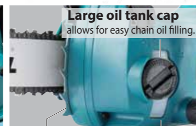
Large oil tank cap allows for easy chain oil filling. Metal spike bar Chain oil level window