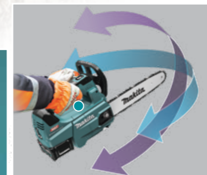
Excellent tool balance