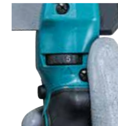
Variable speed control by dial

Low speed 0 - 500 min -1 for mixing high viscous material such as concrete