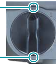
Mechanical 2-speed gearing

Possible to adjust blade speed even finer according to material.