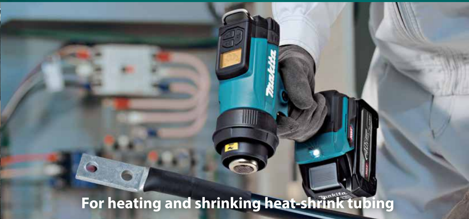
For heating and shrinking heat-shrink tubing