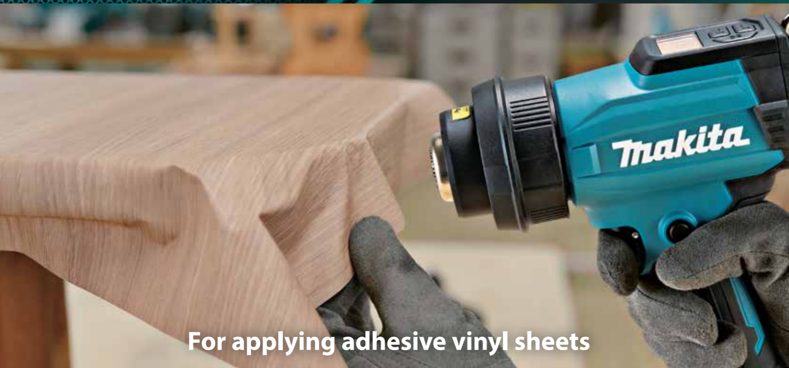
For applying adhesive vinyl sheets