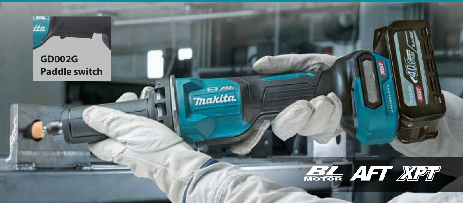
GD002G Paddle switch