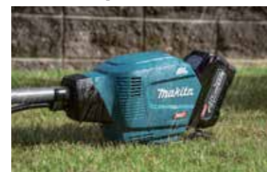
Enhanced Dust and Drip-proof Performance