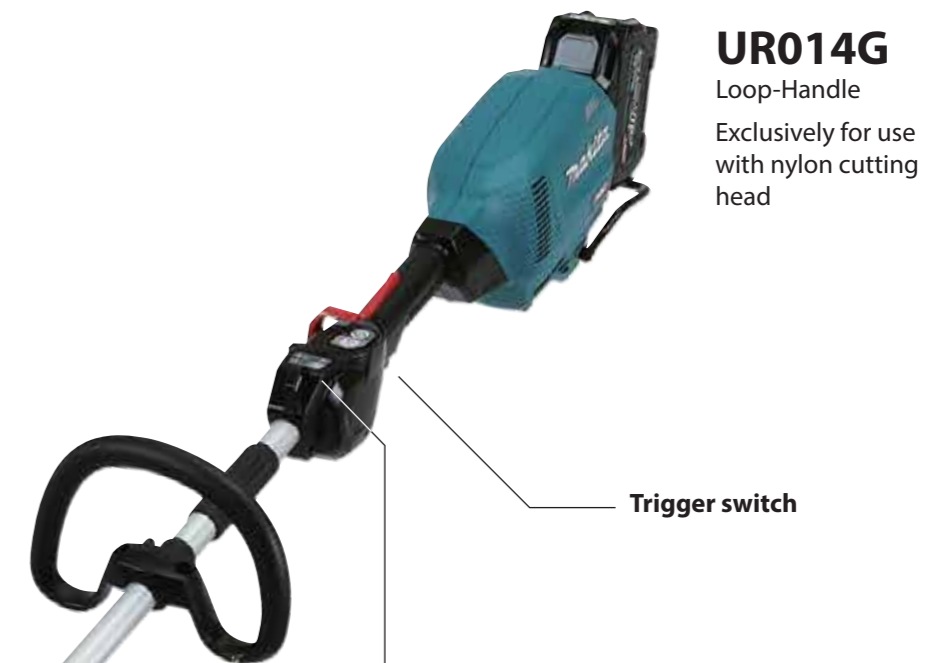
UR014G Loop-Handle Exclusively for use with nylon cutting head