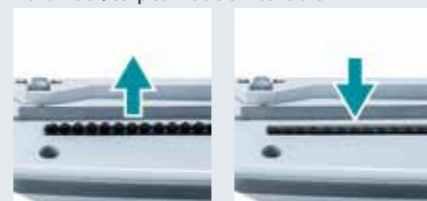
For hard floor