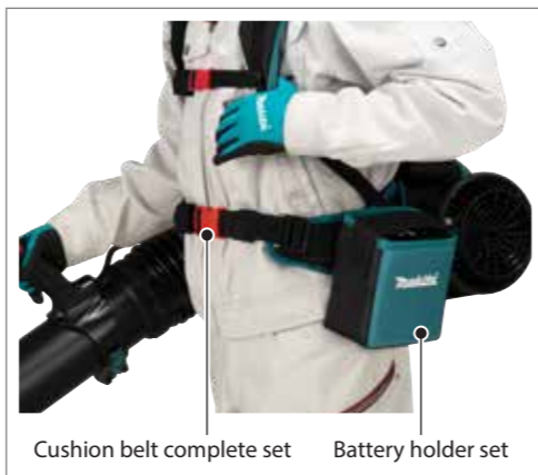
Cushion belt complete set Battery holder set